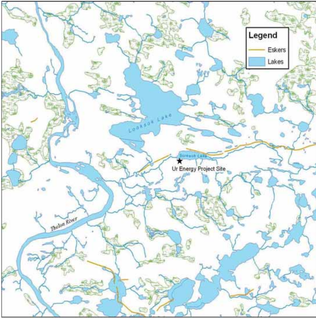
Fig. 2: Project Location