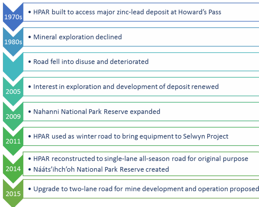
Figure 3: History of the Howard's Pass Access Road

The purpose of the proposed HPARU Project is to widen the road to a width of 8.5 m and make adjustments in alignment to improve the road design. The surface area disturbed by the existing HPAR is approximately: