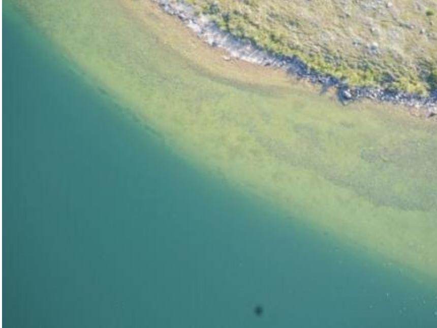
Photo B-6 Lac du Sauvage Serial Shoreline at 541751E 7166788N, August 6, 2013