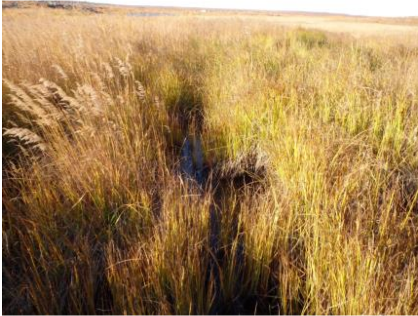
Photo B-102 Stream Ab2 Run Habitat Facing East at 544619E 7160900N, September 14, 2013