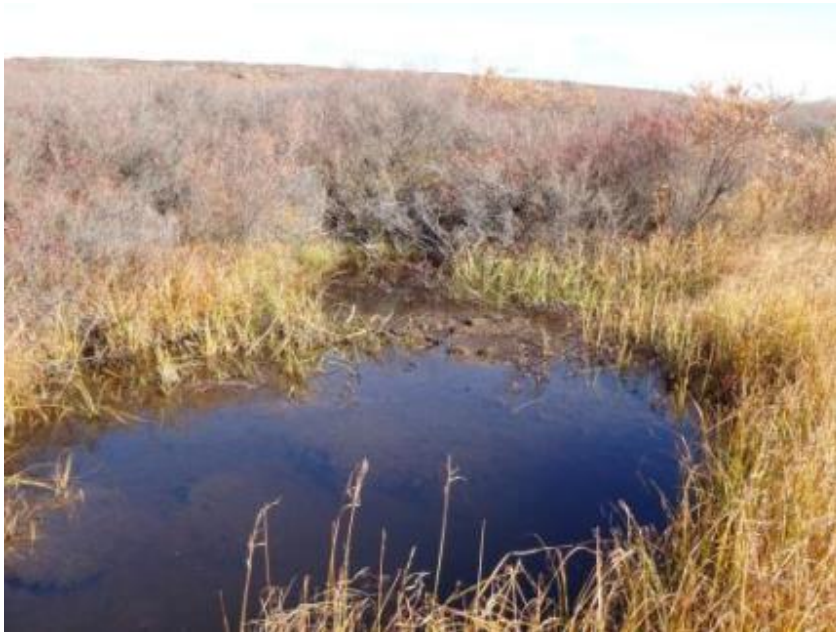
Photo B-104 Lake Ac17 Shoreline Facing Southwest at 12W 545304E 7170802N, September 7, 2013