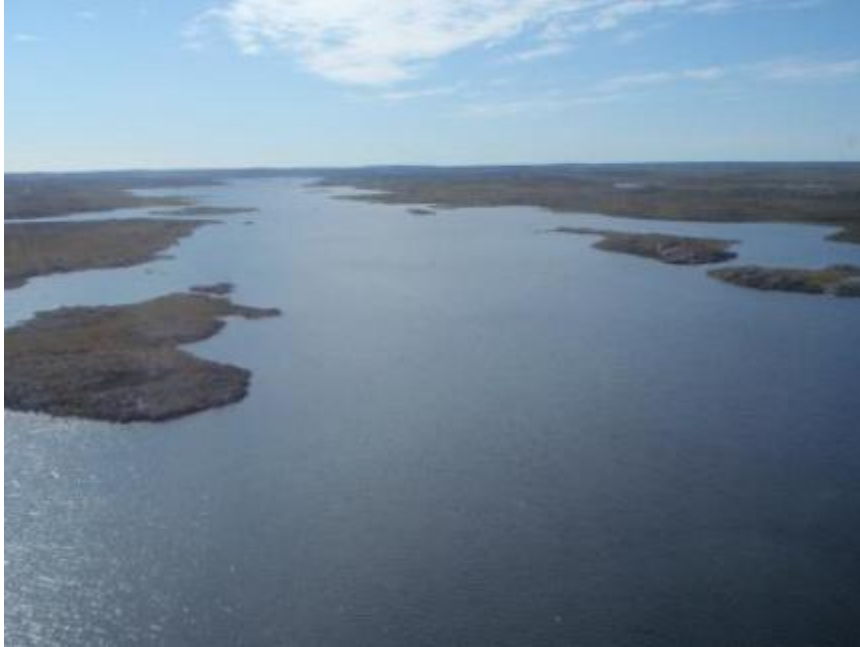
Photo B-124 Paul Creek between Paul Lake, foreground and Lac de Gras, background Facing South at 525592E 7170116N, August 12, 2013