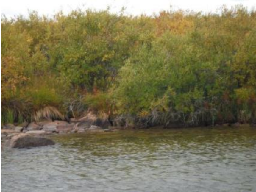
Photo B-84 Lake D2 South Shoreline at 536215E 7169817N, September 1, 2013