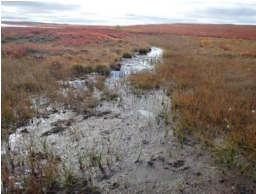
Photo B-118 Stream Ad8, ephemeral Facing South at 535928E 7173073N, September 6, 2013