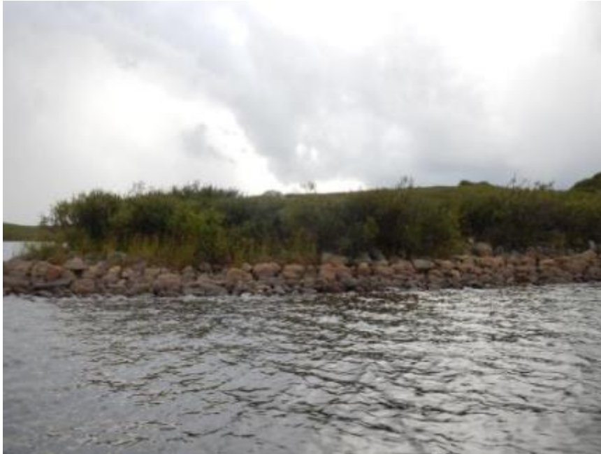
Photo B-18 Lake E1 Shoreline Facing West at 12W 535148E 7174972N, August 19, 2013