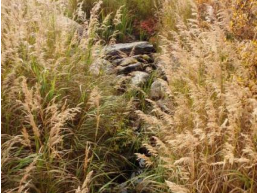
Photo B-110 Stream Ac20, ephemeral Aerial Facing North at 548092E 7169439N, September 15, 2013