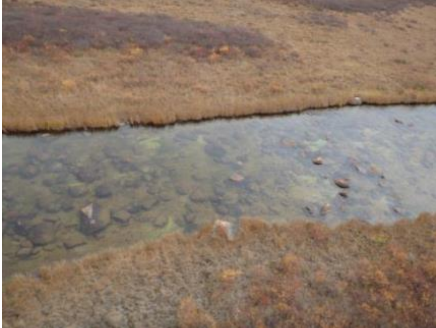
Photo B-34 Stream E2 Aerial Facing South at 535200E 7176583N, September 15, 2013