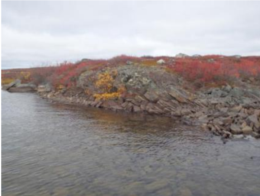
Photo B-68 Lake C3 Shoreline Facing East at 12W 537543E 7165183N, September 13, 2013