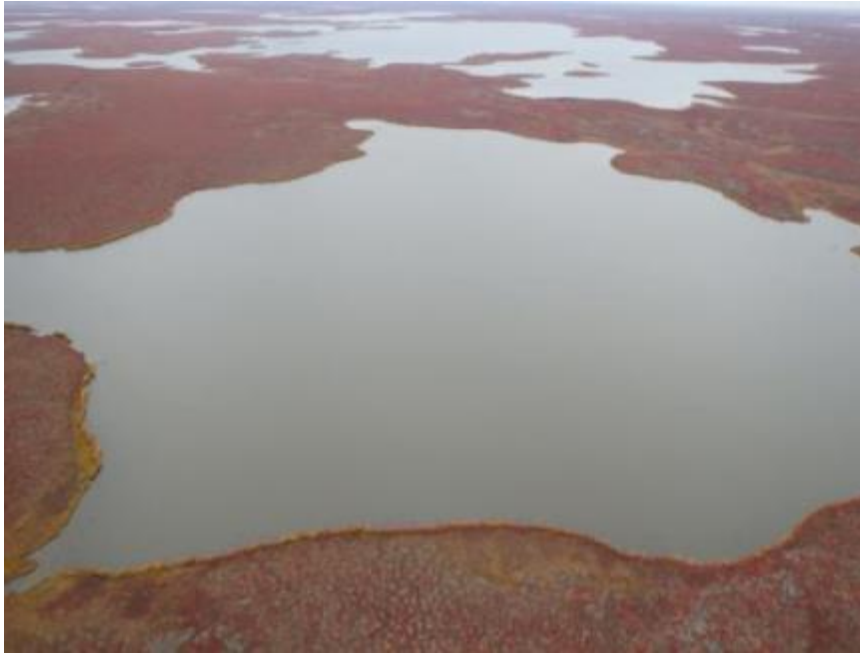
Photo B-108 Stream Ac17, ephemeral Aerial Facing Northeast. Lake Ac17 in Top Right of Photo, September 7, 2013