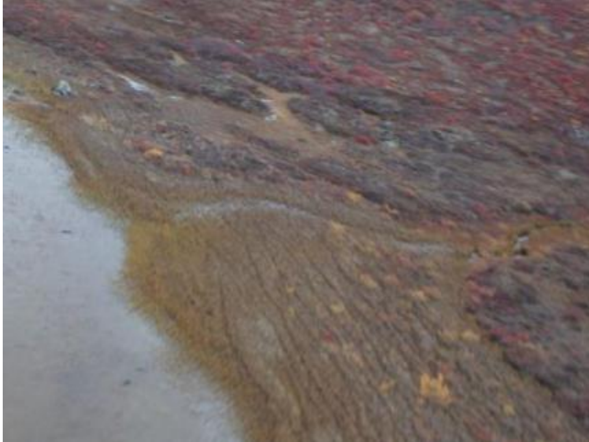
Photo B-60 Lake C1 Shoreline Facing Southeast at 12W 537867E 7166352N, August 26, 2013