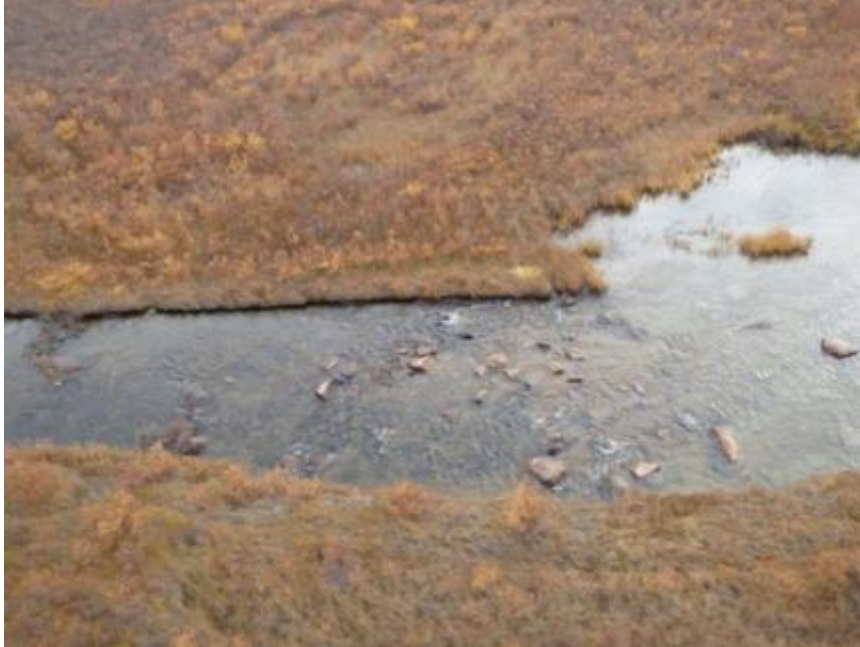
Photo B-30 Stream E2 Aerial Facing South at 535860E 7179517N, September 15, 2013