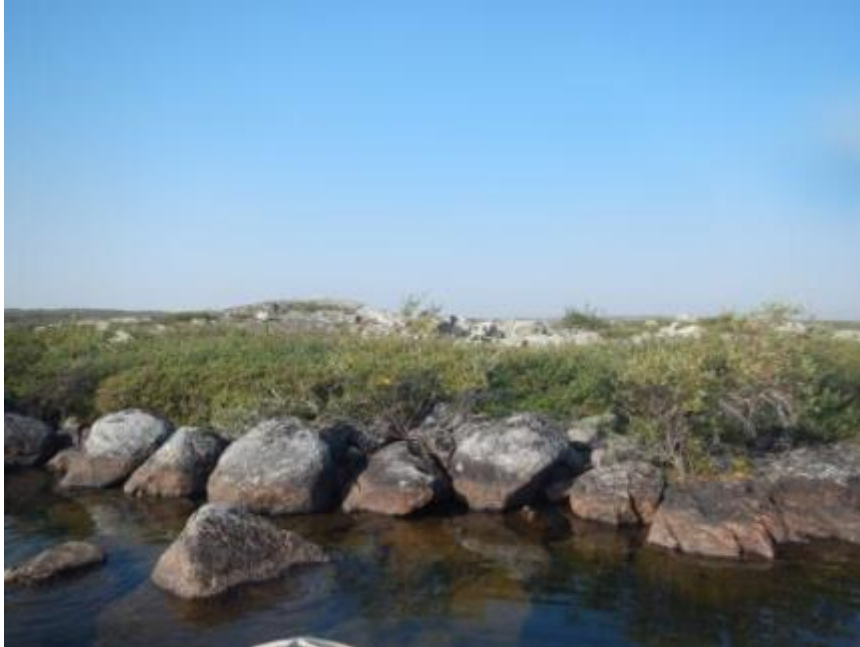
Photo B-122 Paul Lake Shoreline Facing South at 12W 531196E 7173615N, August 13, 2013