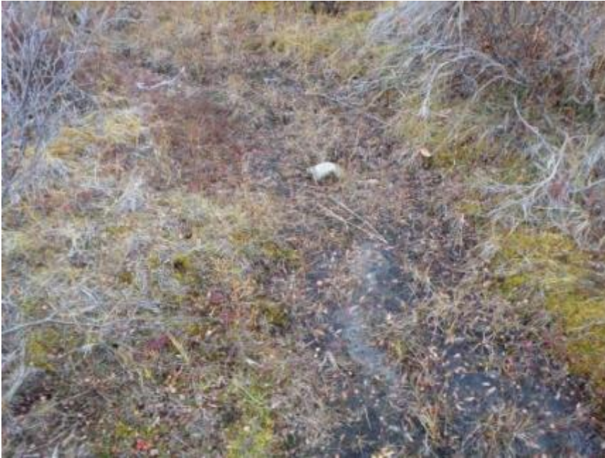
Photo B-112 Stream Ac20, ephemeral Facing East at 548078E 7169492N, September 15, 2013