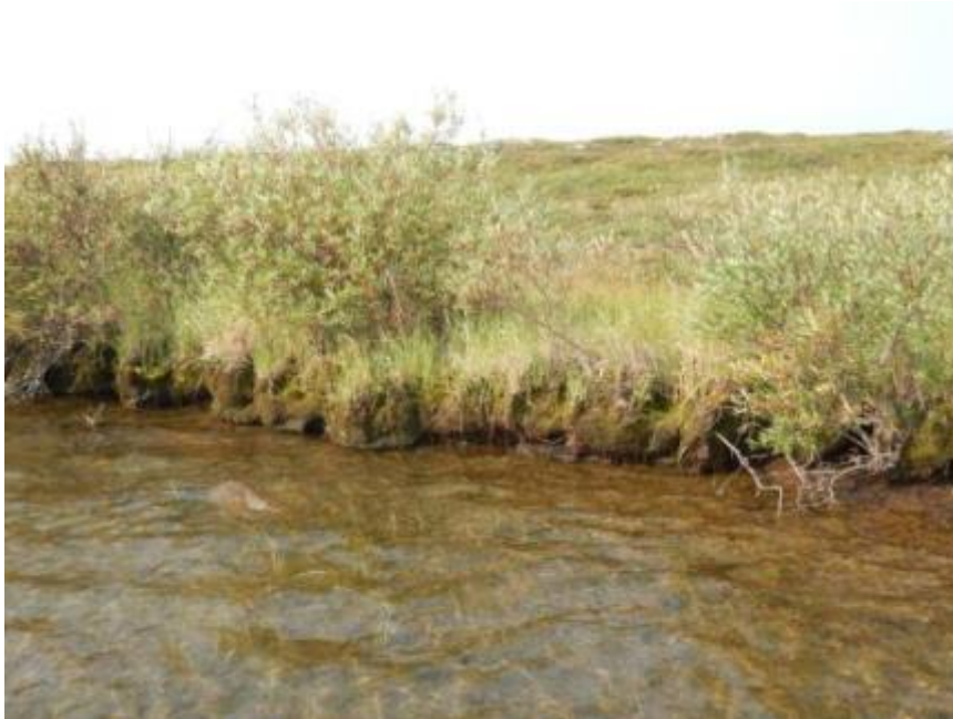
Photo B-12 Lake Af1 Shoreline Facing East at 12W 538459E 7174866N, August 20, 2013