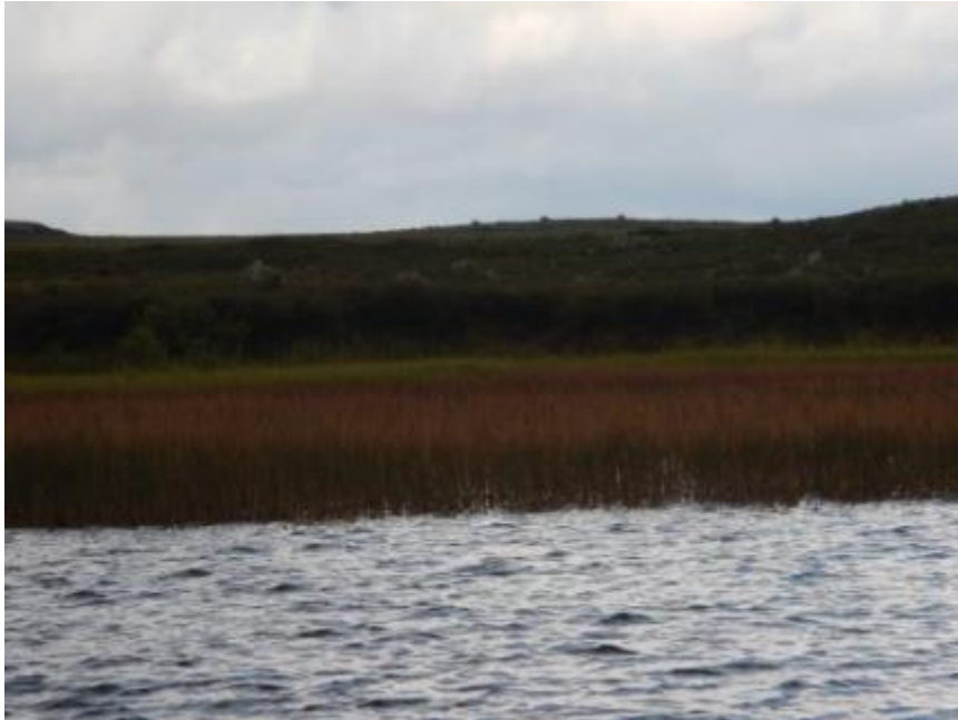
Photo B-20 Lake E1 Shoreline Facing North at 12W 535864E 7174971N, August 19, 2013