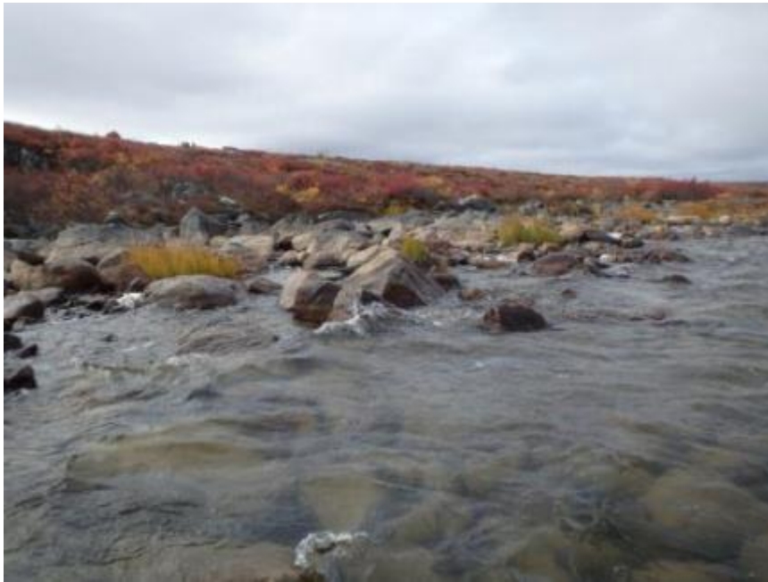
Photo B-66 Lake C3 Shoreline Facing North at 12W 536758E 7165651N, September 13, 2013