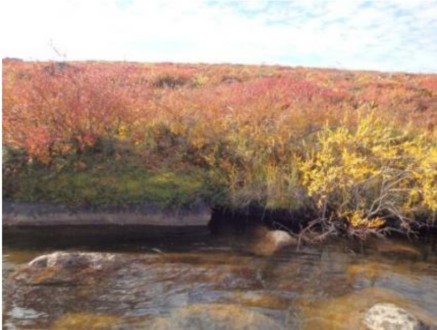
Photo B-114 Lake Ad8 Shoreline Facing East at 12W 535954E 7173293N, September 6, 2013