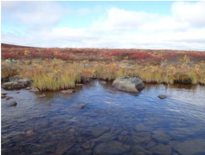
Photo B-50 Lake B15 Shoreline Facing Southeast at 12W 537717E 7163560N, September 11, 2013