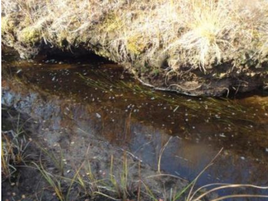
Photo B-58 Stream B15 Pool Habitat Facing West at 538342E 7164082N, September 12, 2013