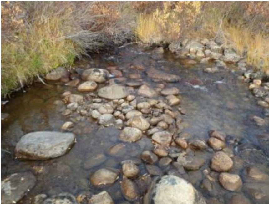
Photo B-94 Stream D1 Riffle Habitat at 536957E 7170677N, September 15, 2013