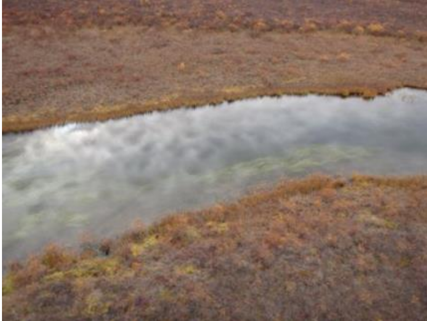
Photo B-32 Stream E2 Aerial Facing South at 535219E 7176844N, September 15, 2013