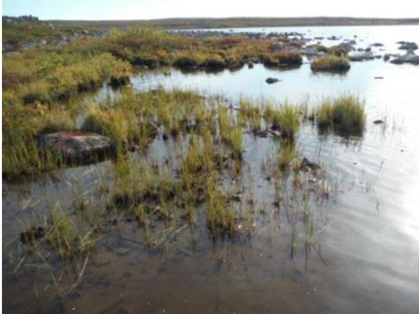
Photo B-90 Lake D4 Shoreline Facing West at 534306E 7167880N, August 31, 2013