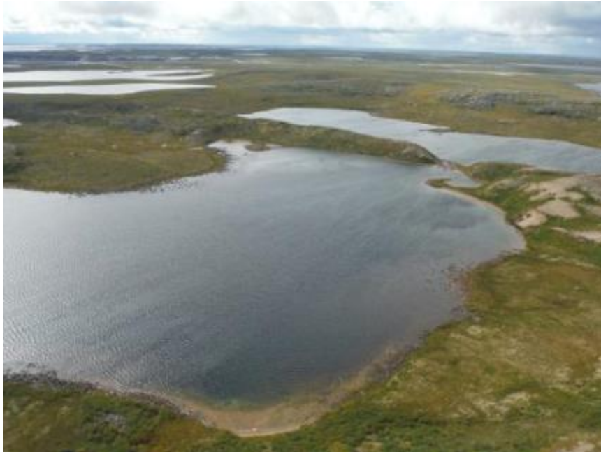
Photo B-42 Lake B4, Cujo Lake Shoreline Facing South at 538704E 7161800N, September 3, 2013