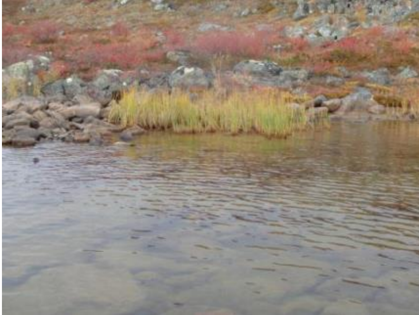
Photo B-48 Lake B15 Shoreline Facing Northwest at 12W 536915E 7163596N, September 11, 2013