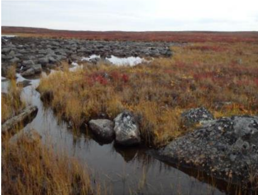
Photo B-80 Stream C3 Run Habitat Facing Northeast at 537373E 7165546N, September 12, 2013