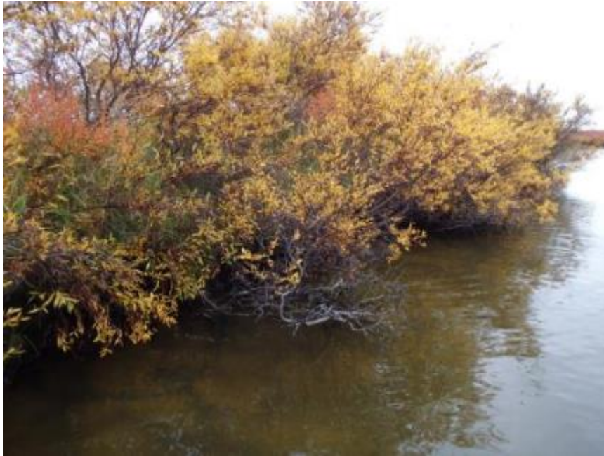
Photo B-106 Lake Ac17 Shoreline Facing North at 12W 545992E 71712292N, September 7, 2013