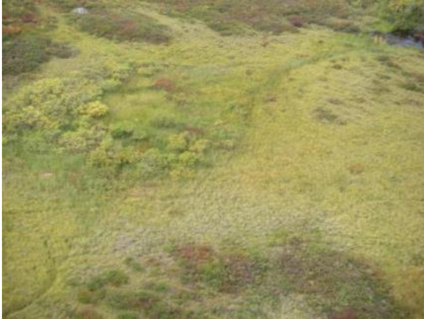
Photo B-140 Lynx Creek Aerial Facing Northwest at Lac du Sauvage, bottom right near 537895E 7157696N, August 28, 2013