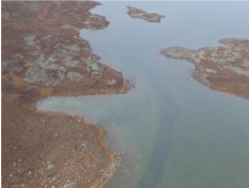
Photo B-16 Lake E1 Shoreline Facing Northeast at 12W 535973E 7174265N, August 17, 2013