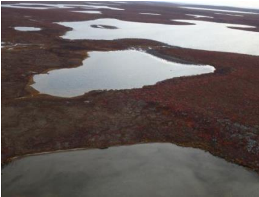
Photo B-64 Lake C3 Shoreline Facing Northeast at 12W 537513E 7165065N, September 13, 2013