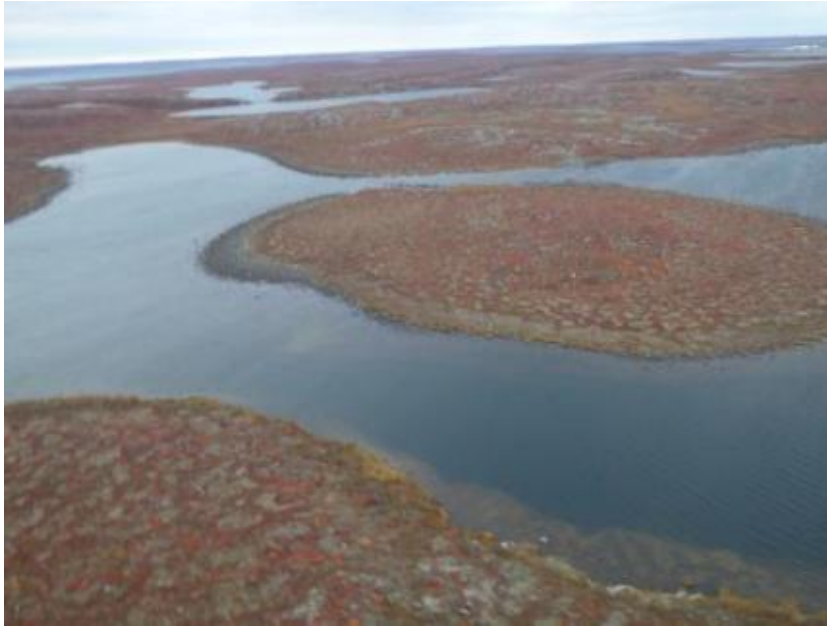
Photo B-52 Stream B1, Christine Creek Aerial Facing East Toward Lake B1 at 540227E 7163882N, August 22, 2013