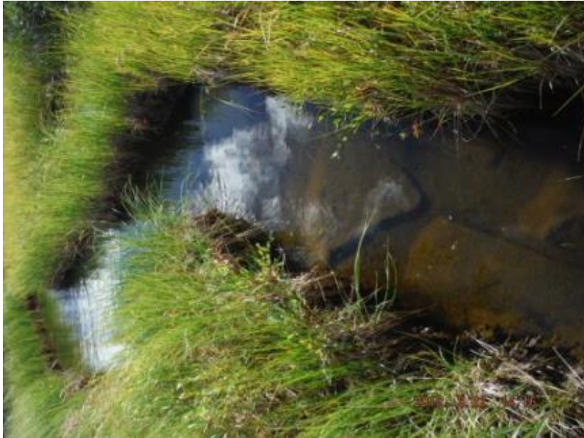
Photo B-54 Stream B1, Christine Creek Flat Habitat Facing West at 540765E 7163813N, August 22, 2013