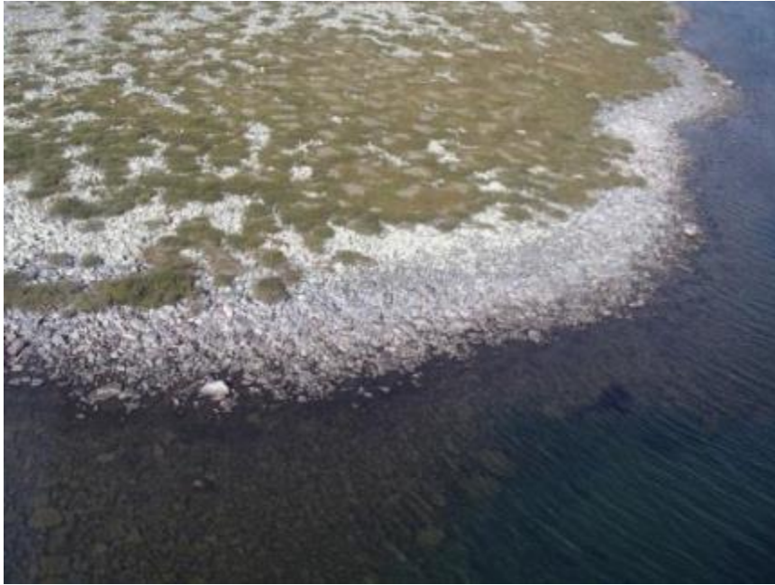
Photo B-4 Lac du Sauvage Aerial Shoreline at 541208E 7167397N, August 6, 2013