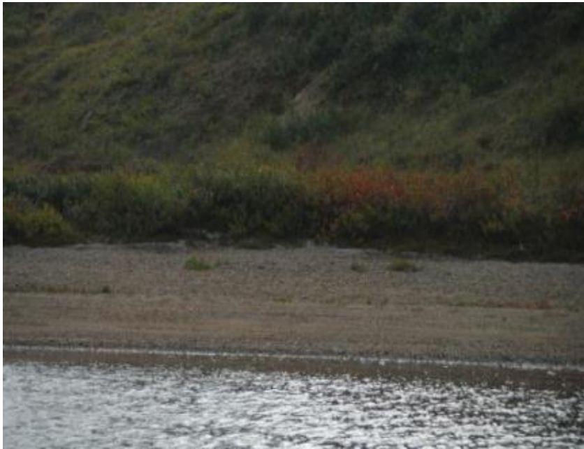
Photo B-40 Lake B1, Christine Lake Shoreline Facing East at 12W 538994E 7163863N, August 25, 2013