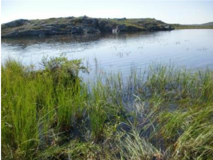
Photo B-120 Paul Lake Shoreline Facing Southwest at 12W 525779E 7170349N, August 12, 2013