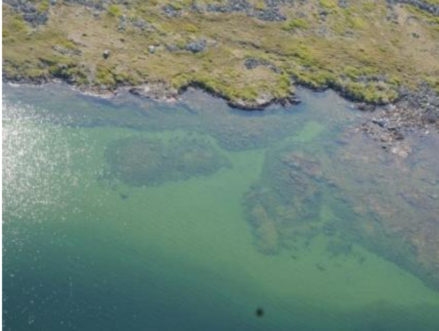
Photo B-8 Duchess Lake Shoreline Facing North at 12W 541134E 7176031W, August 15, 2013