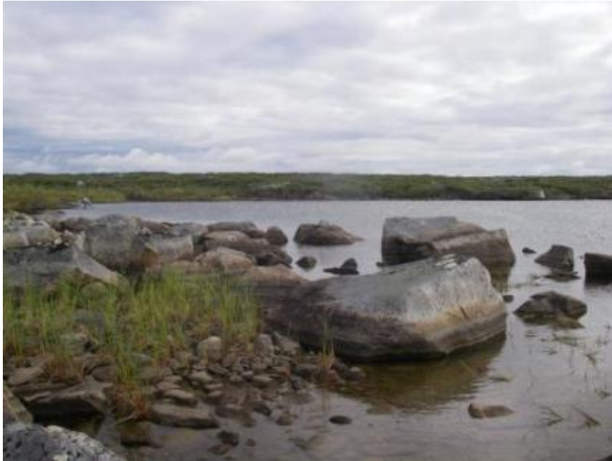
Photo B-2 Lac du Sauvage Shoreline Facing South at 541043E 7165891N, August 23, 2013