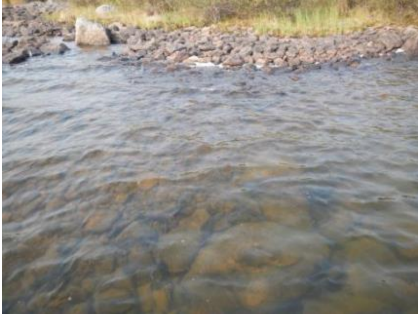
Photo B-10 Duchess Lake Shoreline Facing East at 12W 542224E 7175273W, August 15, 2013