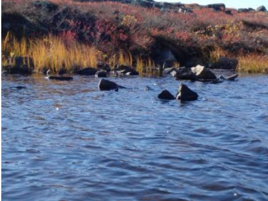
Photo B-100 Small Stream Connecting the Sections of Lake Ab2 Facing West at 12W 544402E 7160911N, September 14, 2013