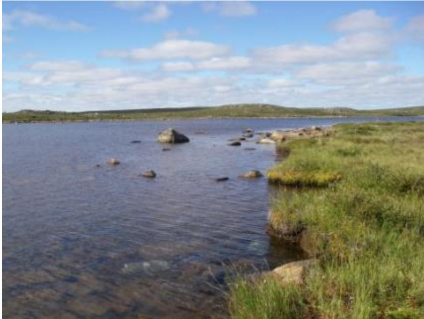
Photo B-128 Hammer Lake Shoreline Facing North at 536531E 7158365N, August 25, 2013