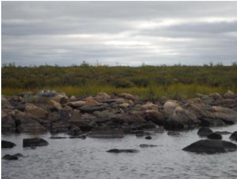
Photo B-38 Lake B1, Christine Lake Shoreline Facing South at 12W 539517E 7163633N, August 25, 2013