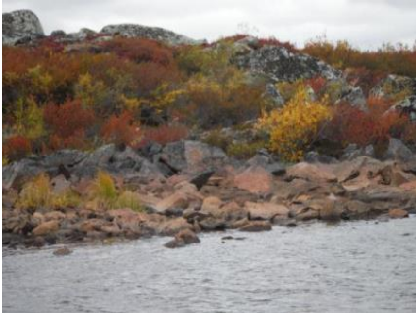
Photo B-82 Lake D2 Shoreline Facing Northeast at 536541E 7170221N, September 1, 2013