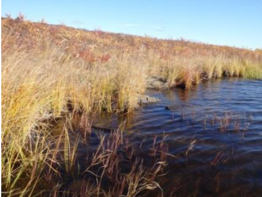
Photo B-98 Lake Ab2 Shoreline Facing Northeast at 12W 5444563E 7160915N, September 14, 2013