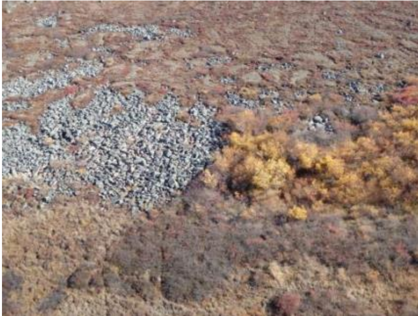
Photo B-138 Lynx Creek Aerial Facing Northeast near Outlet to Lynx Lake, left of photo near 537519E 7158191N, August 28, 2013