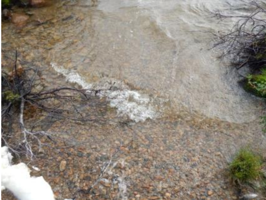
Photo B-14 Lake Af1 Shoreline Facing Southeast at 12W 538444E 7174895N, August 20, 2013