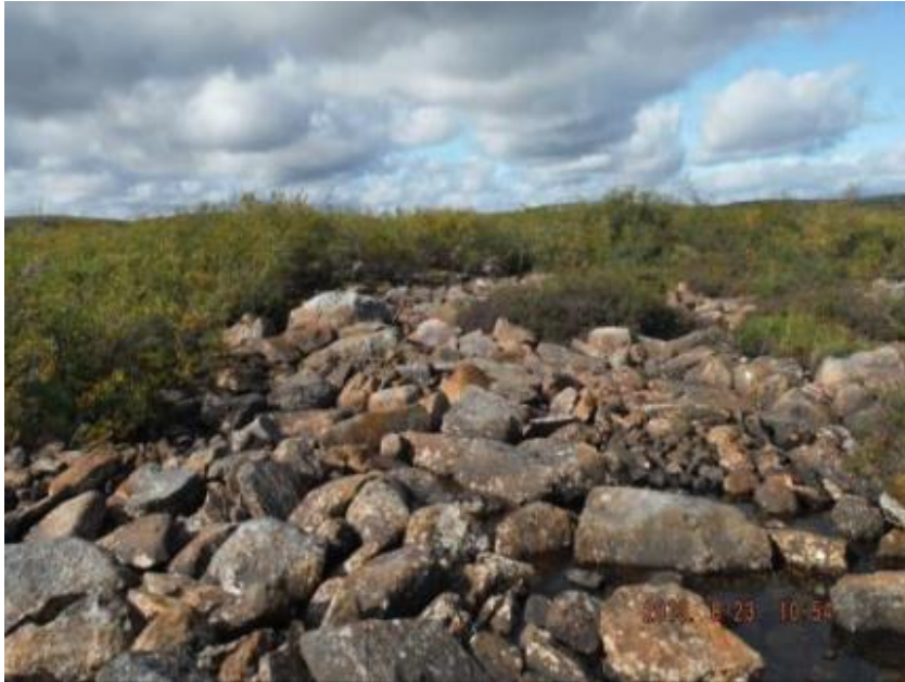
Photo B-56 Stream B15 Flooded Flat Habitat Facing East at 538254E 7164102N, September 11, 2013