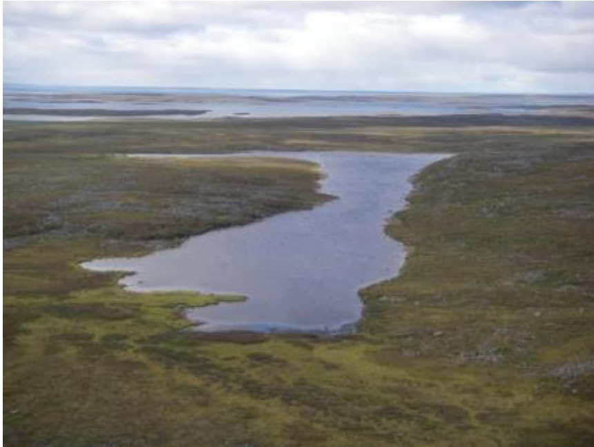
Photo B-132 Lynx Lake Shoreline at 537308E 7158386N, August 27, 2013