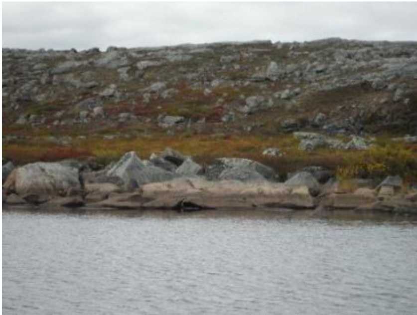
Photo B-88 Lake D3, Counts Lake Shoreline Facing South at 534141E 7168854N, August 30, 2013