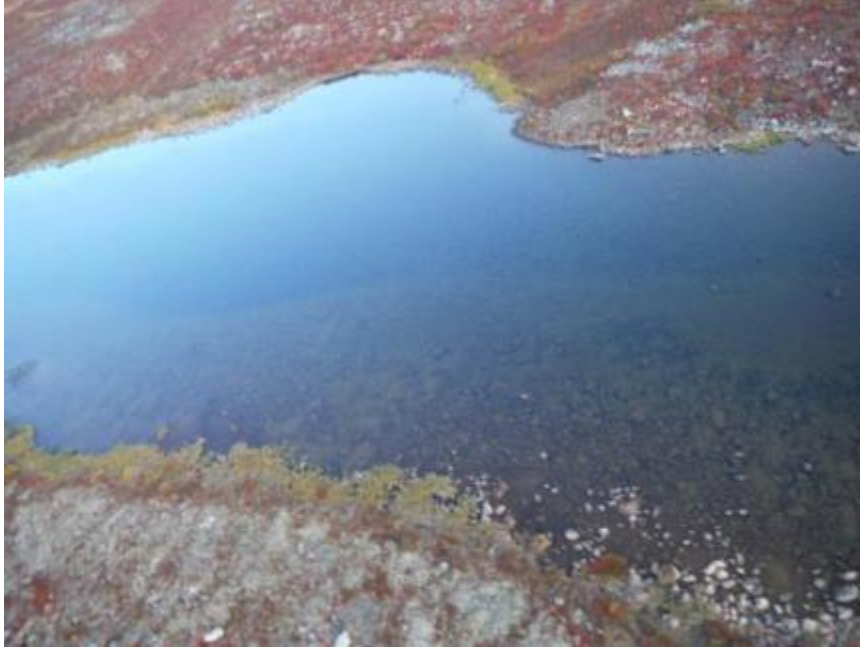
Photo B-86 Lake D3, Counts Lake Aerial Shoreline at 534337E 7170064N, August 30, 2013