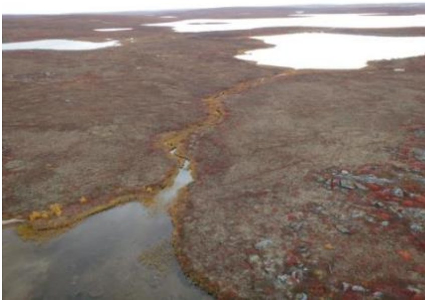
Photo B-76 Stream C3 Aerial Facing Southwest at 537272E 7165521N Between Lake C3, background and Lake C2, foreground, September 12, 2013