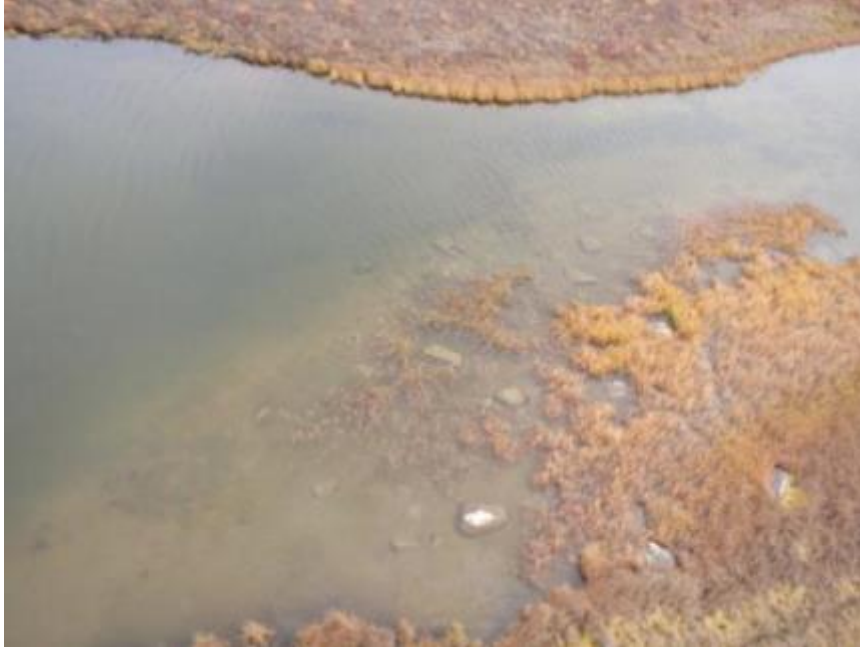
Photo B-36 Stream E2 at Outlet to Lake E1 Aerial Facing Southwest at 535200E 7176583N, September 15, 2013