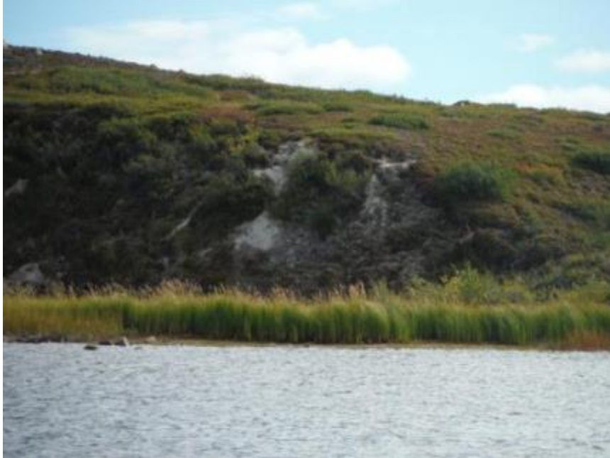
Photo B-62 Lake C1 Shoreline Facing Southeast at 12W 537944E 7166580N, August 26, 2013