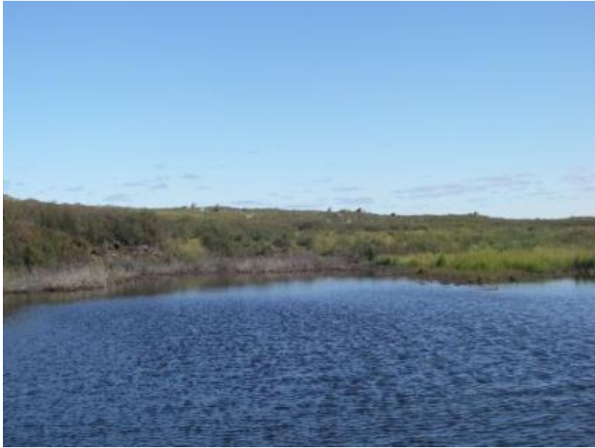
Photo B-130 Hammer Lake Shoreline Facing North at 536183E 7158068N, August 26, 2013