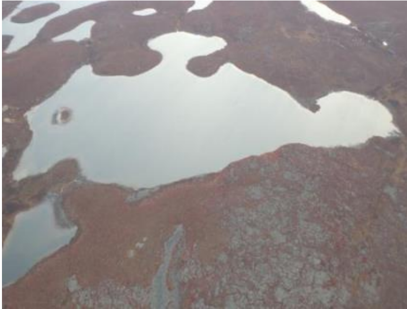
Photo B-70 Stream C1 Aerial Facing North at Surveyed Location near Lac du Sauvage Outlet at 540123E 7166867N, September 14, 2013