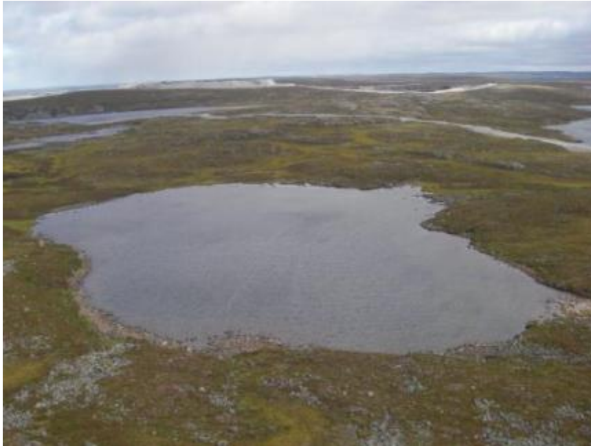
Photo B-136 Hammer Creek Aerial Facing Southeast toward Lac de Gras Near 536679E 7157942N, September 14, 2013