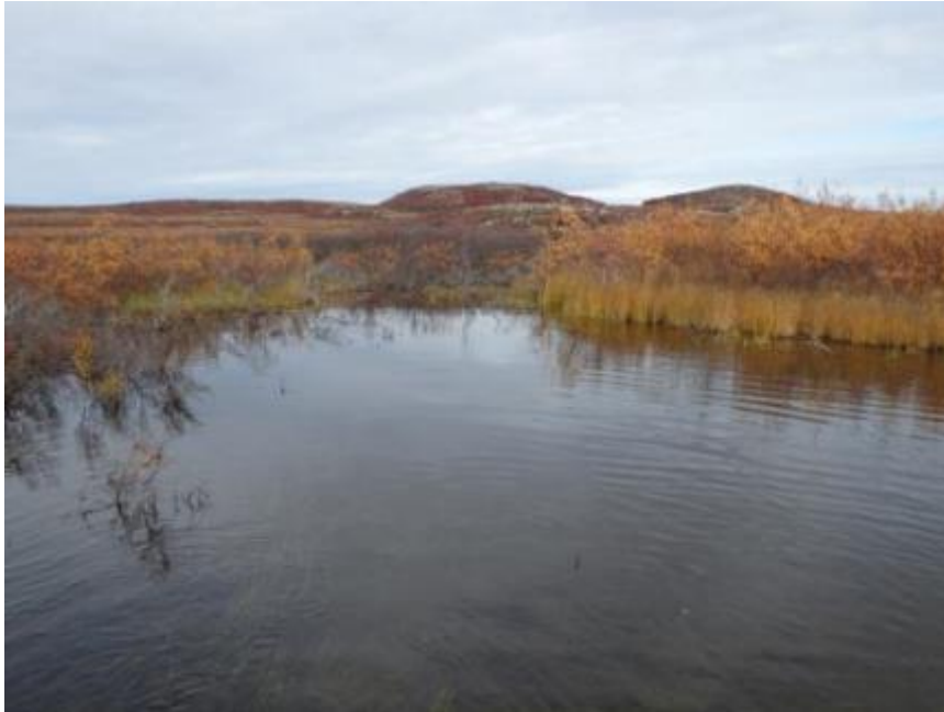
Photo B-96 Stream D1 Run Habitat Facing South at 536964E 7170634N, September 15, 2013