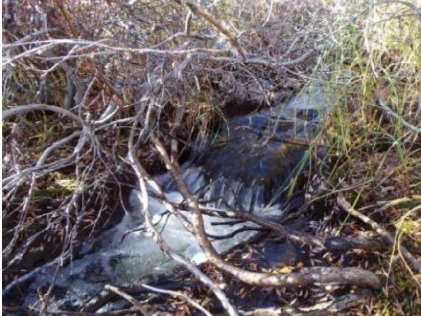
Photo B-74 Stream C1 Run Habitat with Submerged Vegetation and No Willow Cover at 540086E 7166929N, September 14, 2013