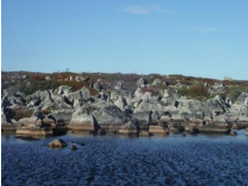
Photo B-92 Stream D1 Aerial Facing Southwest at 540161E 7166927N, Lac du Sauvage in Foreground, September 14, 2013