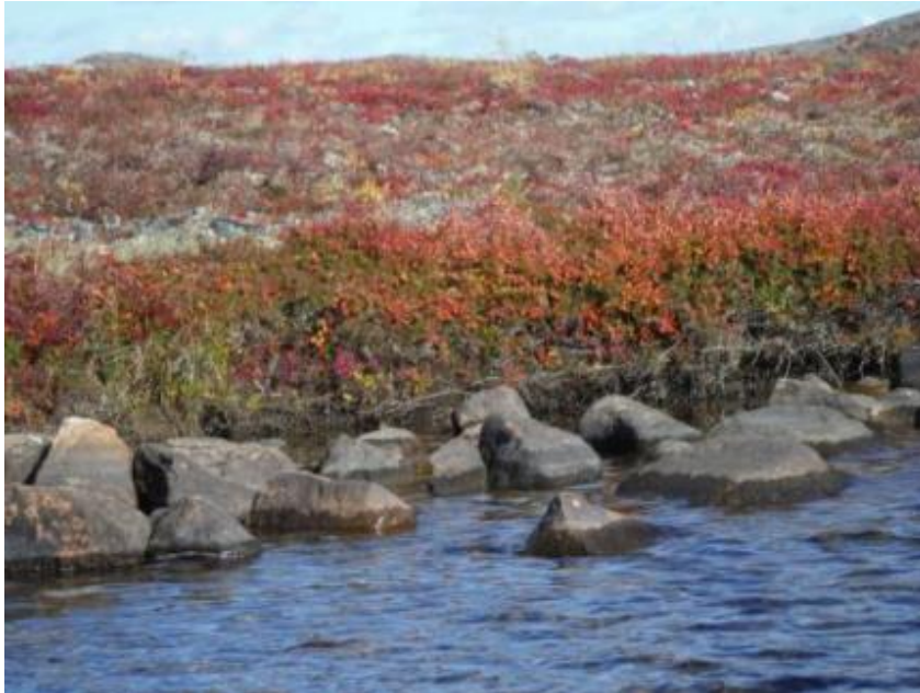
Photo B-44 Lake B4, Cujo Lake Shoreline Facing South at 538610E 7162035N, September 3, 2013