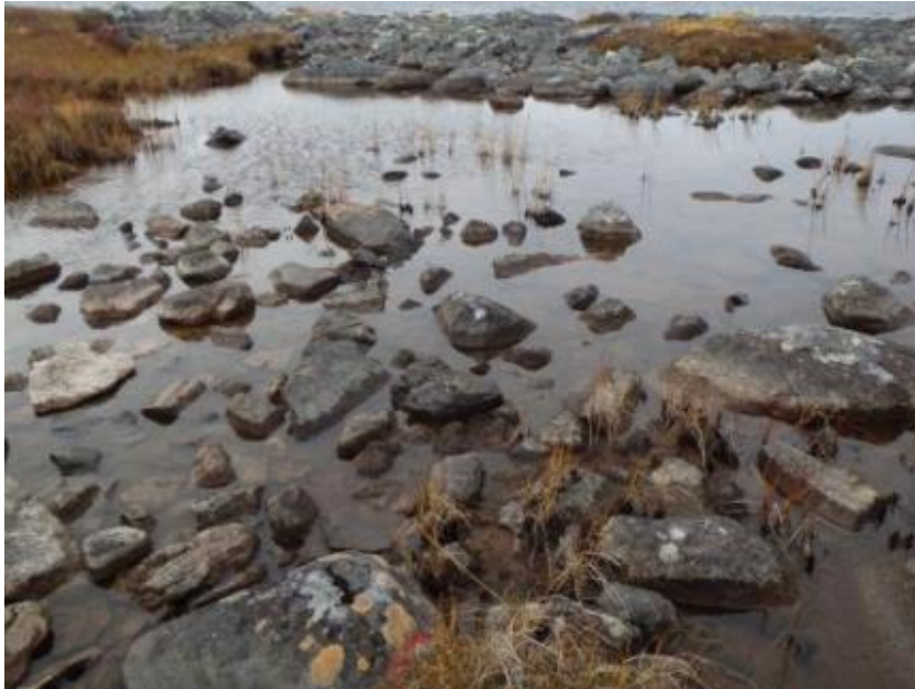
Photo B-78 Stream C3 Run Habitat Facing Northeast at 537369E 7165556N, Lake C2 in Background, September 12, 2013