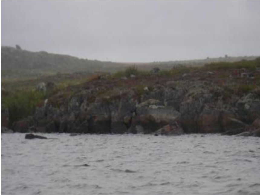
Photo B-134 Lynx Lake Shoreline Facing North at 537433E 7158392N, August 27, 2013