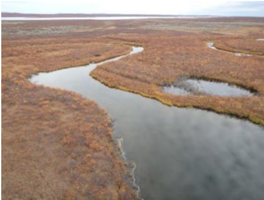
Photo B-26 Stream E2 Aerial Facing Southeast at 534902E 7180443N, September 15, 2013