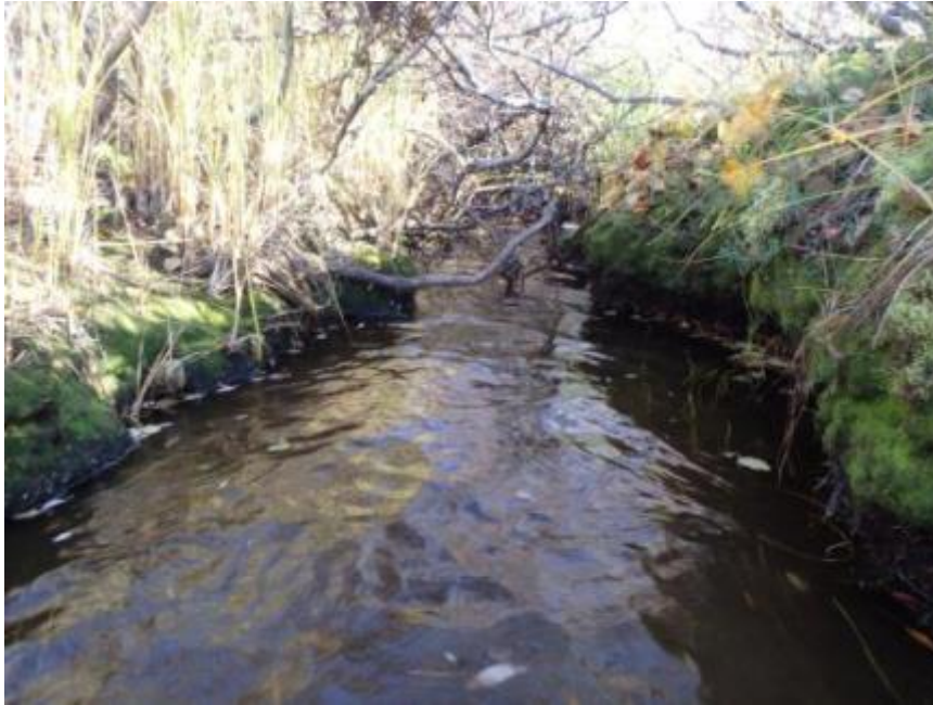
Photo B-72 Stream C1 Pool Habitat Facing North at 540202E 7166938N, September 14, 2013