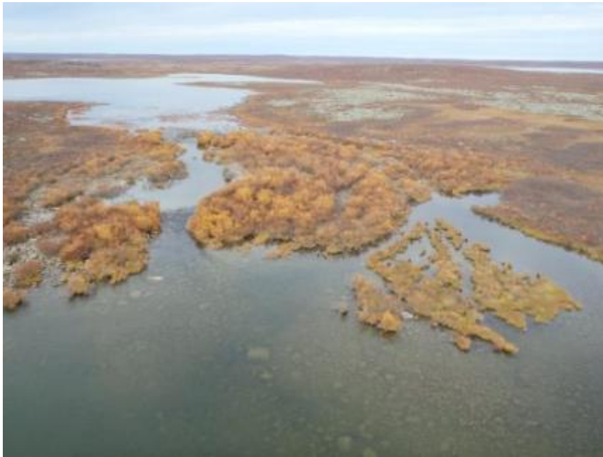
Photo B-24 Stream E2 Aerial Facing East at 536089E 7177527N, September 15, 2013