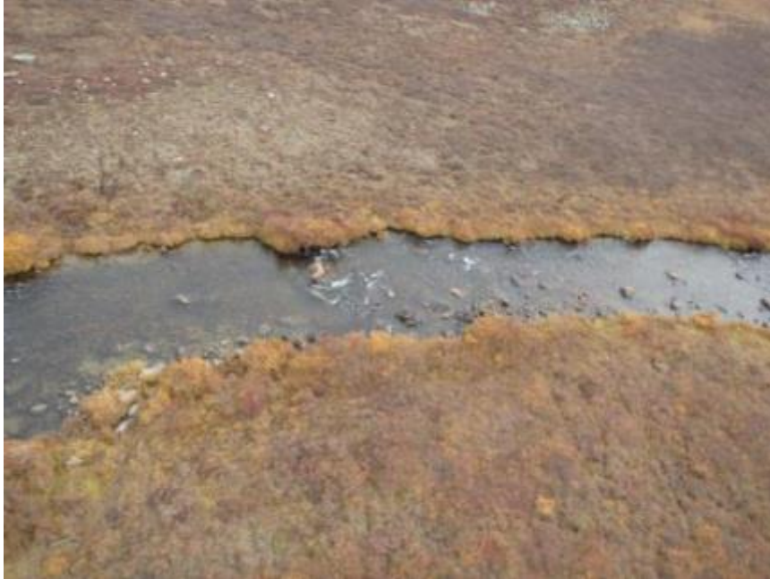
Photo B-28 Stream E2 Aerial Facing North at 536102E 7177264N, September 15, 2013