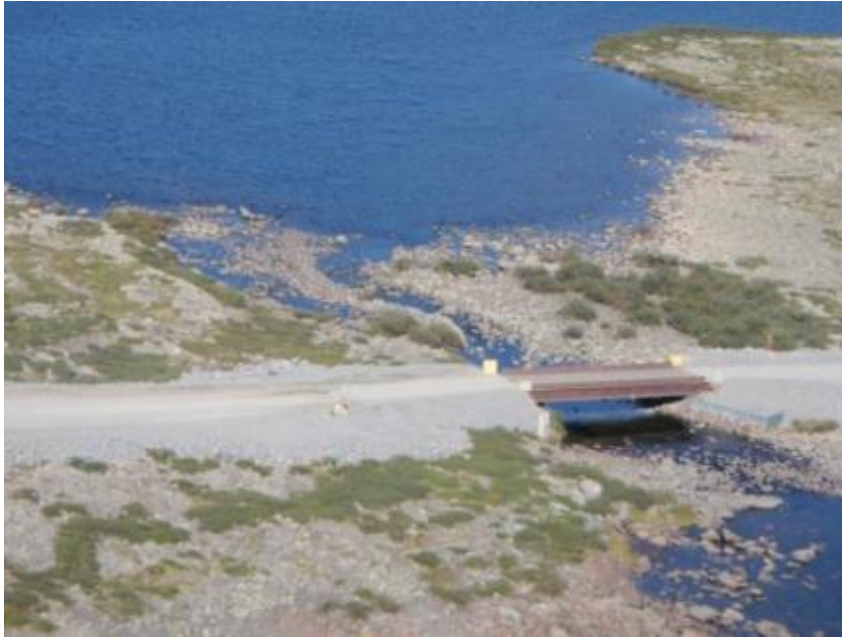
Photo B-126 Hammer Lake Shoreline Facing South Toward Outlet at 536390E 7158057N, August 25, 2013