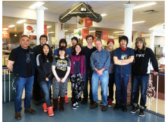
Students from Kugluktuk on a tour of Ekati mine (LWB)