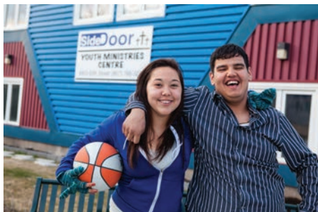
Side Door program in Yellowknife

The program Bringing Hope and Prosperity Back allows staff to engage with youth to identify resources, develop plans for their future and to provide various support and mentoring while they are using the emergency shelter.