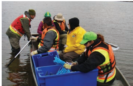
Tłjcho community members participate in a Fish Health Survey

Prior to the fish-out, a Ceremony of Respect will be held to honour the land, water, and culture. Harvestable fish will be distributed to the communities. The team for the fish-out will include community members, biologists, and a project supervisor from Dominion.