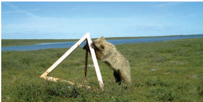
A grizzly bear at one of the DNA collection posts (DDC)

Traditional knowledge was sought from community elders and land users for the design and placement of posts, which were used to gather grizzly bear hair samples for DNA analysis.