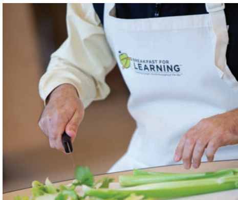
The Breakfast for Learning program serves up nutritious food for students