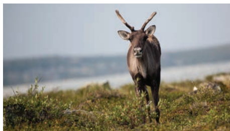
Caribou at Ekati

We are continuing to build on this program in 2015 by hiring more community monitors for both the Misery pit and our power line construction along the Misery Road.