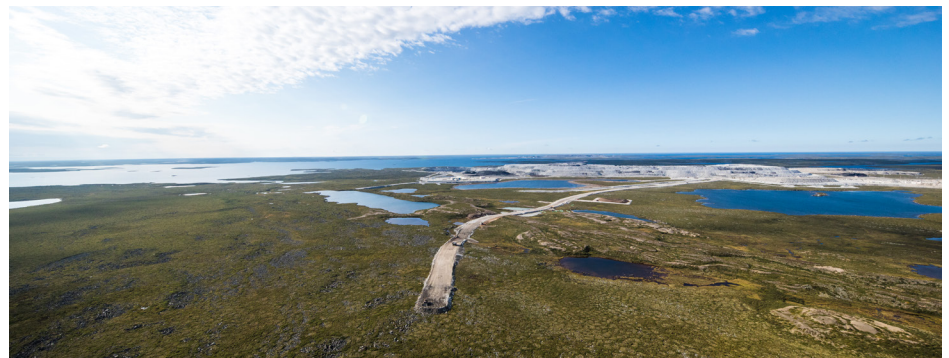
Jay Road construction, August 2017.