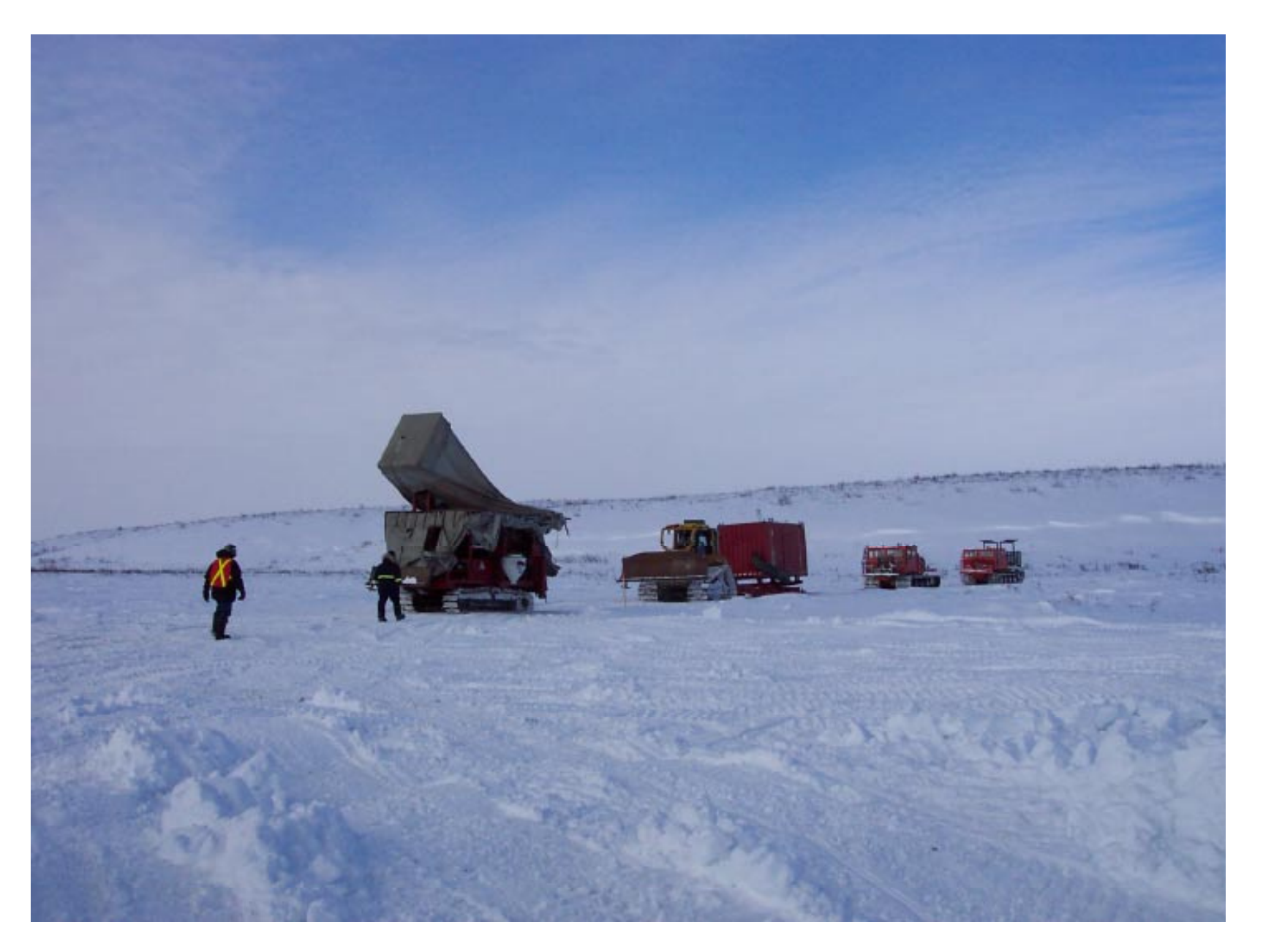
Operations: Drill and support equipment mobilizing to a new site – ISR Winter 2003