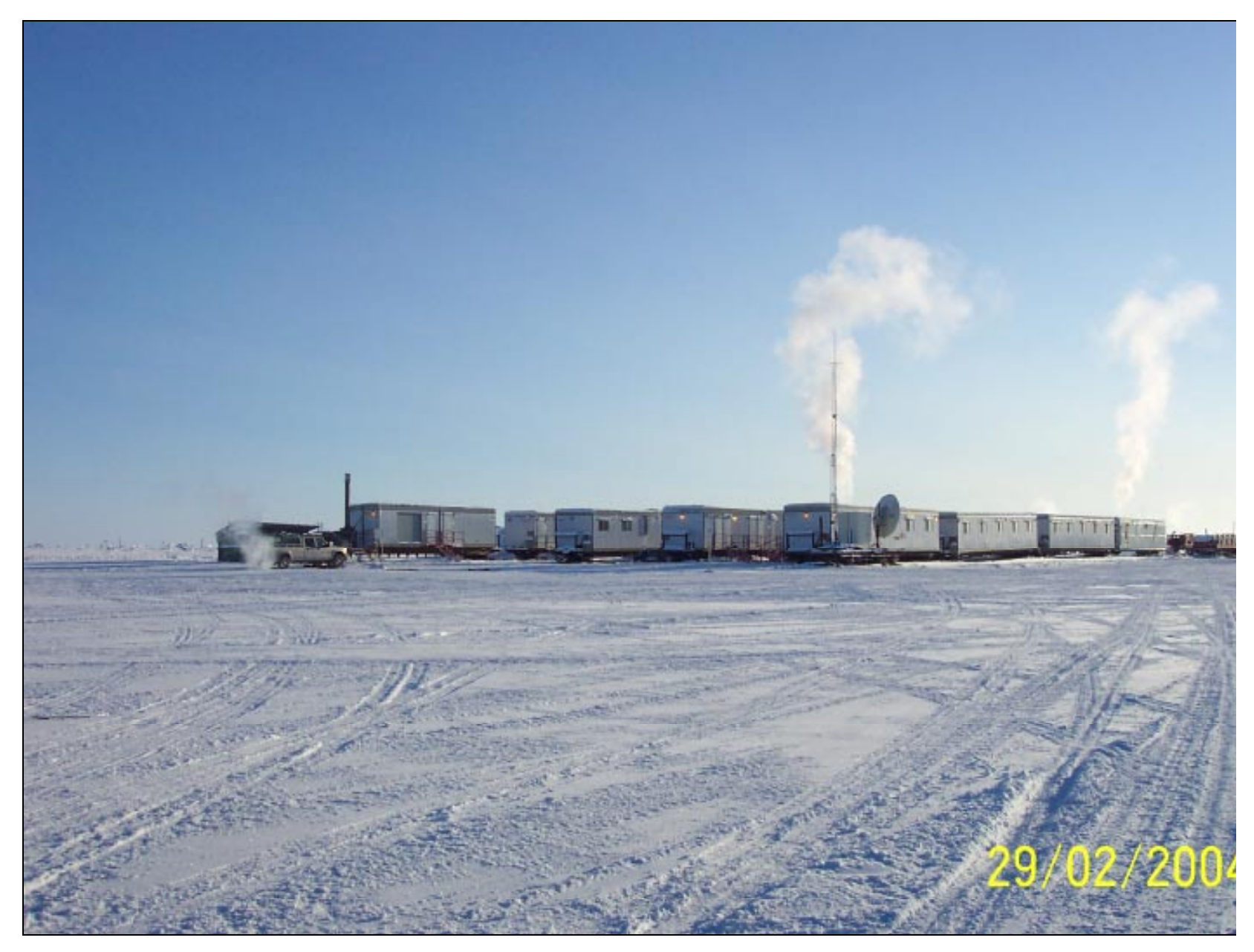
Access: Sleigh camp - GSA Winter 2004