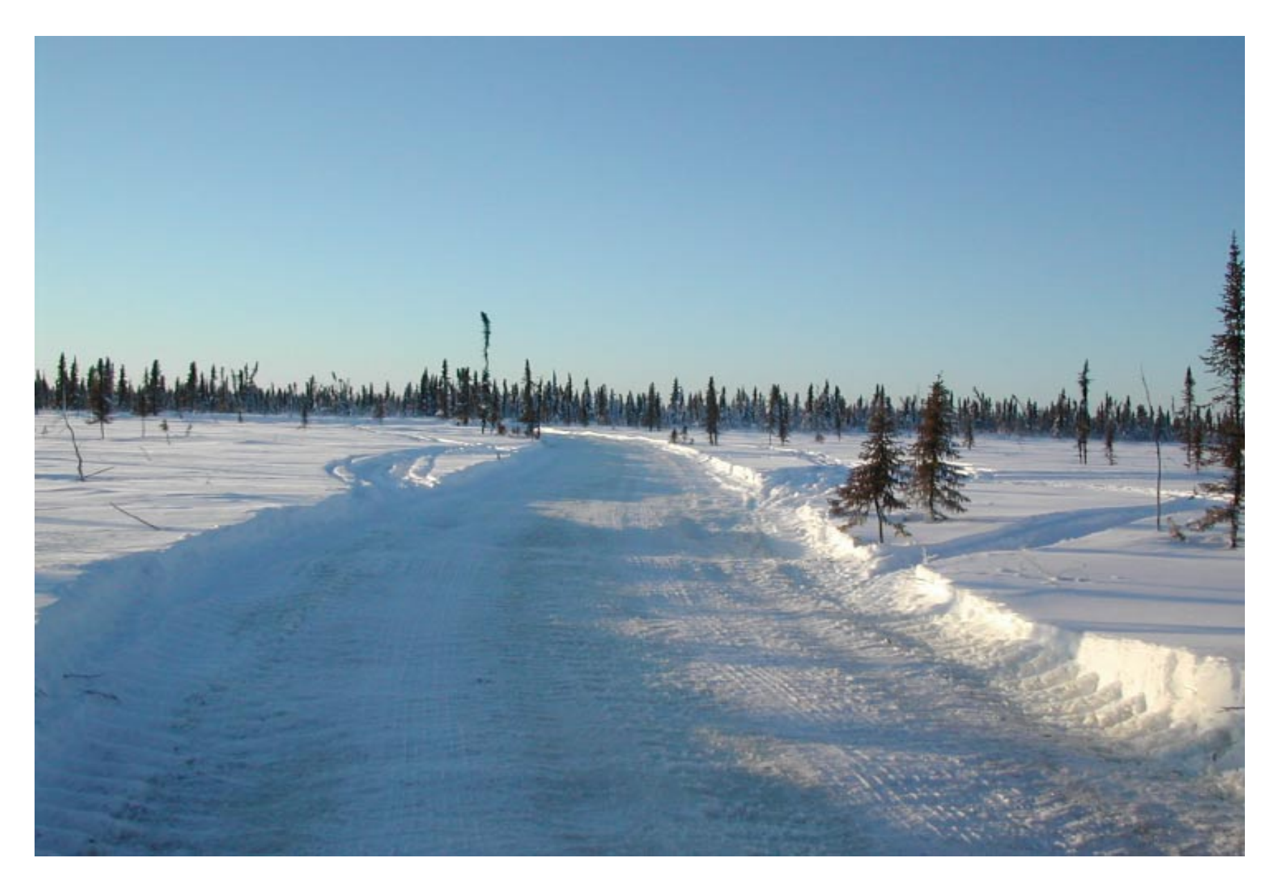
Access: Six-metre access trail construction – GSA Winter 2004