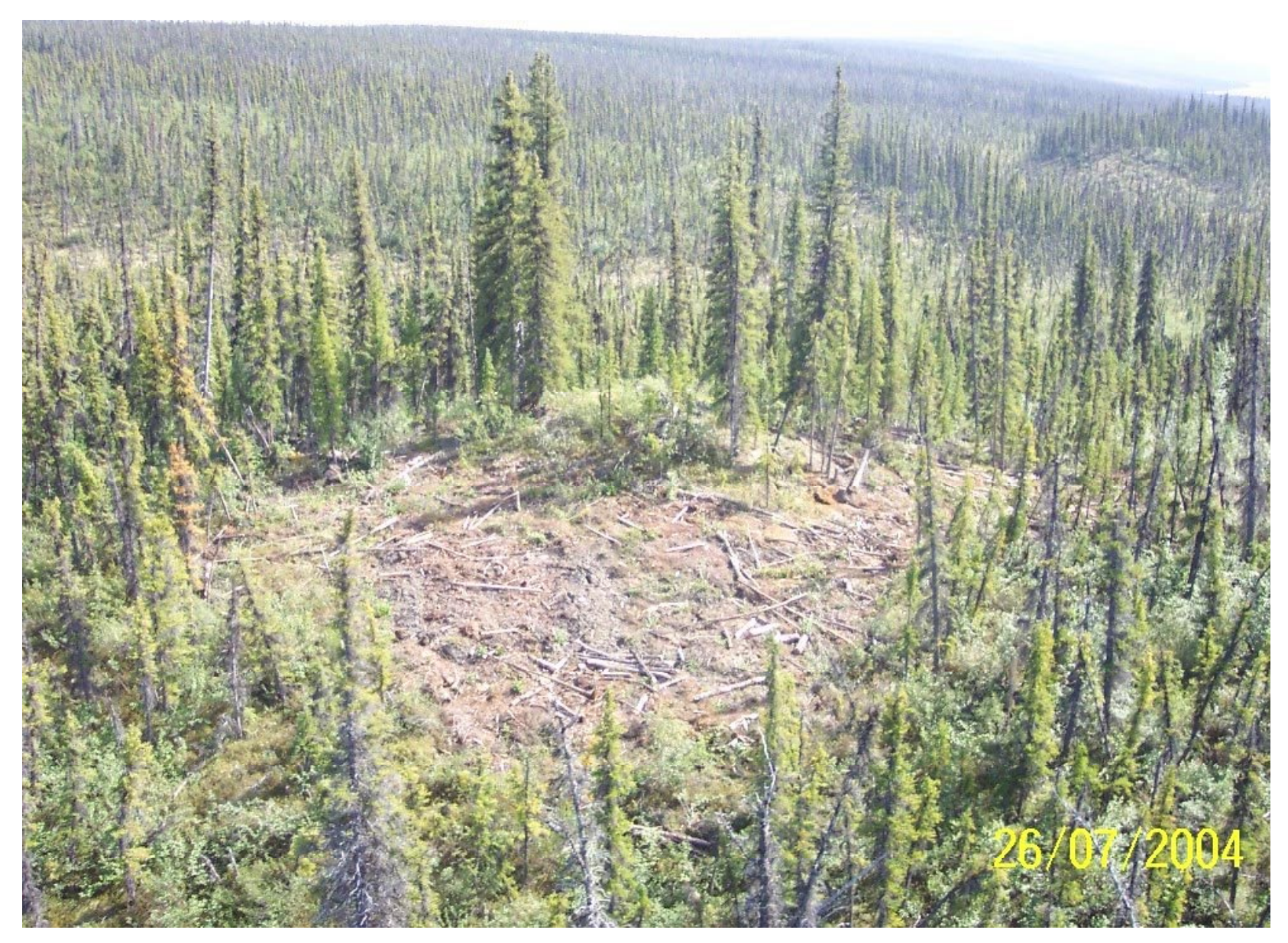
Access: Site 4.024P GSA Summer 2004 after remedial work completed in Winter 2004