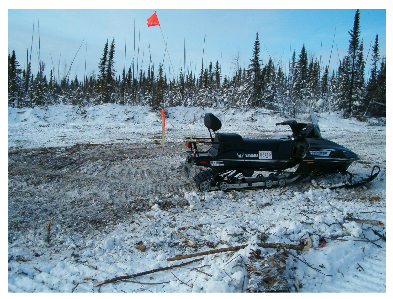
Access: Cleaned-up test pit – Sahtu K'ahsho Got'ine Winter 2004