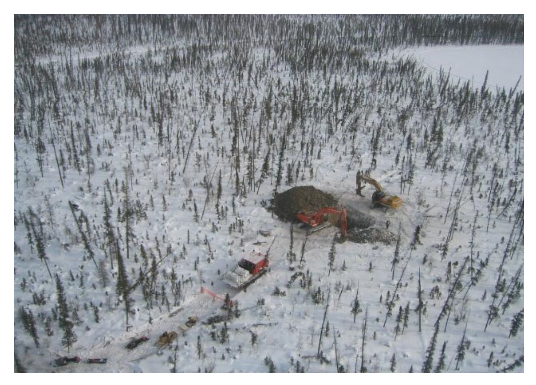
Operations: Excavating test pit at Site 6.042P in Sahtu K'ahsho Got'ine Winter 2004