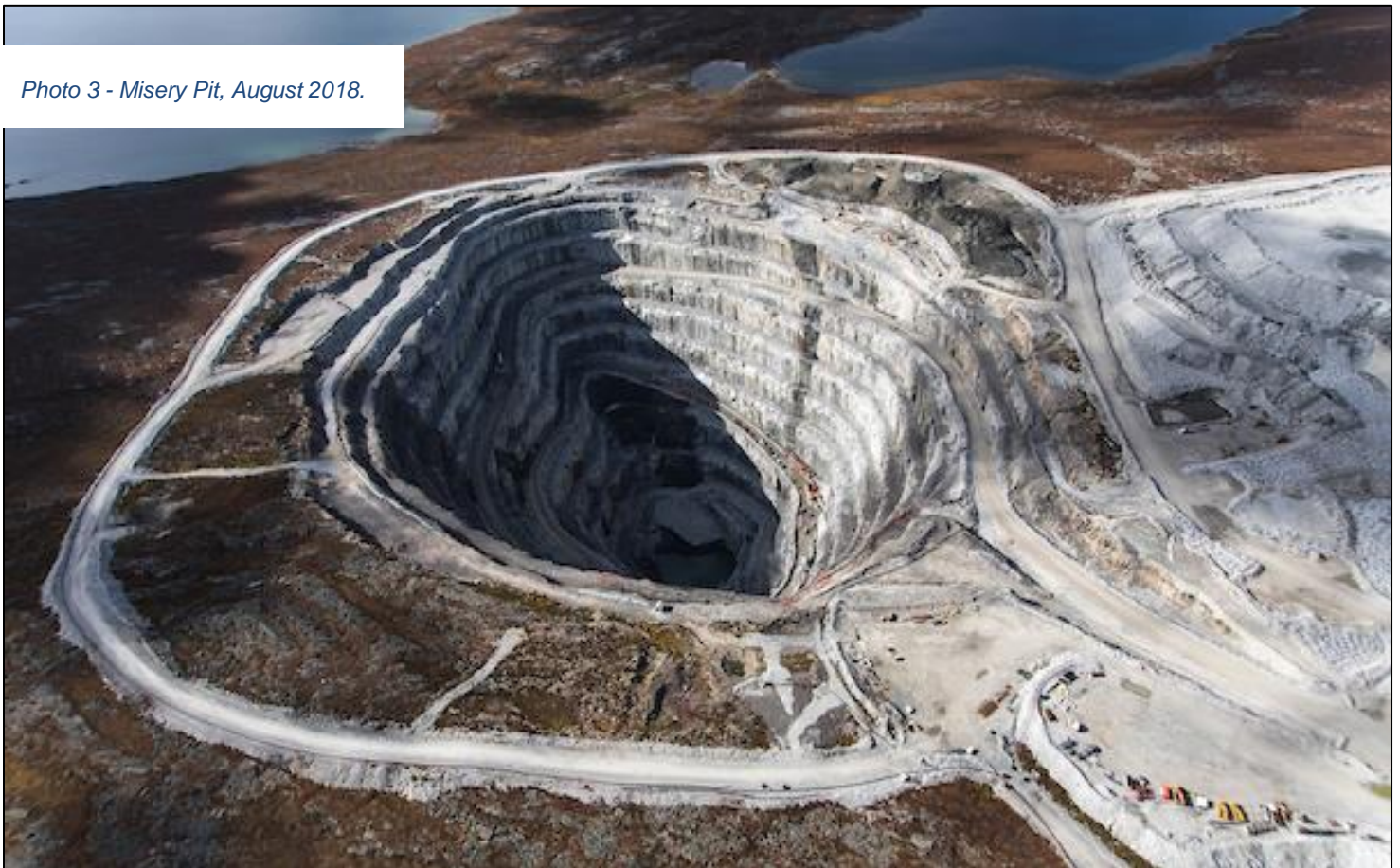
Photo 3 - Misery Pit, August 2018.

There were no other specific reporting requirements noted in either the EA measures set out in the REA or summarized in Appendix A.