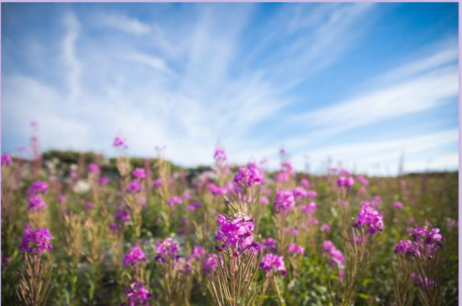
Photo 9 - Fireweed, Ekati Diamond Mine, Summer.

However, the Measure requires Dominion to report annually on how TK influenced Jay Project decision-making. This information, when available, can be found in Dominion's Annual Report which will be submitted to the WLWB in April of each year. The 2018 Report is available on the WLWB's online public registry under file W2012L2-0001 ( W2012L2-0001-Ekati-2018 Water Licence and EA Annual Report-Apr 29 19.pdf ). There will also be information on how TK influenced decision making for the Jay Project and the Ekati mine in other reporting to be prepared by Dominion (e.g. AEMP, WEMP, etc.).