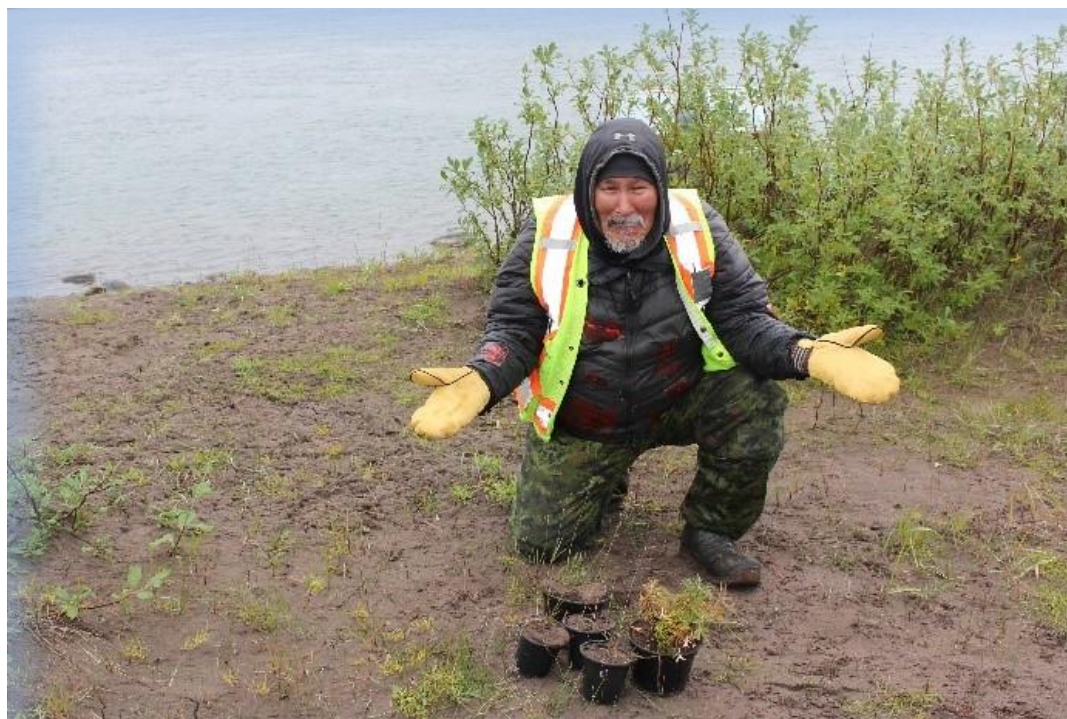
Photo 1 - Transplants from Coppermine River Estuary (Photo August 28, 2018)

As the WLWB is responsible for Measure 4-1, Dominion will not be reporting on this Measure in the manner as required by Measure 13-3 items (a) through (d). To assist the WLWB in the implementation of this Measure, Dominion submitted the Interim Closure and Reclamation Plan (ICRP Version 3.0) as per Part K of the Water Licence W2012L2-0001 on August 15, 2018 ( W2012L2-0001-Ekati-ICRP-Version 3.0 Part 1-Aug 15 18.pdf and W2012L2-0001-Ekati-ICRP-Version 3.00-Part 2-Aug 15 18.pdf ). The ICRP Version 3.0 closure objectives and criteria are organized according to mine components and include the Jay Project. The review of this item is ongoing.