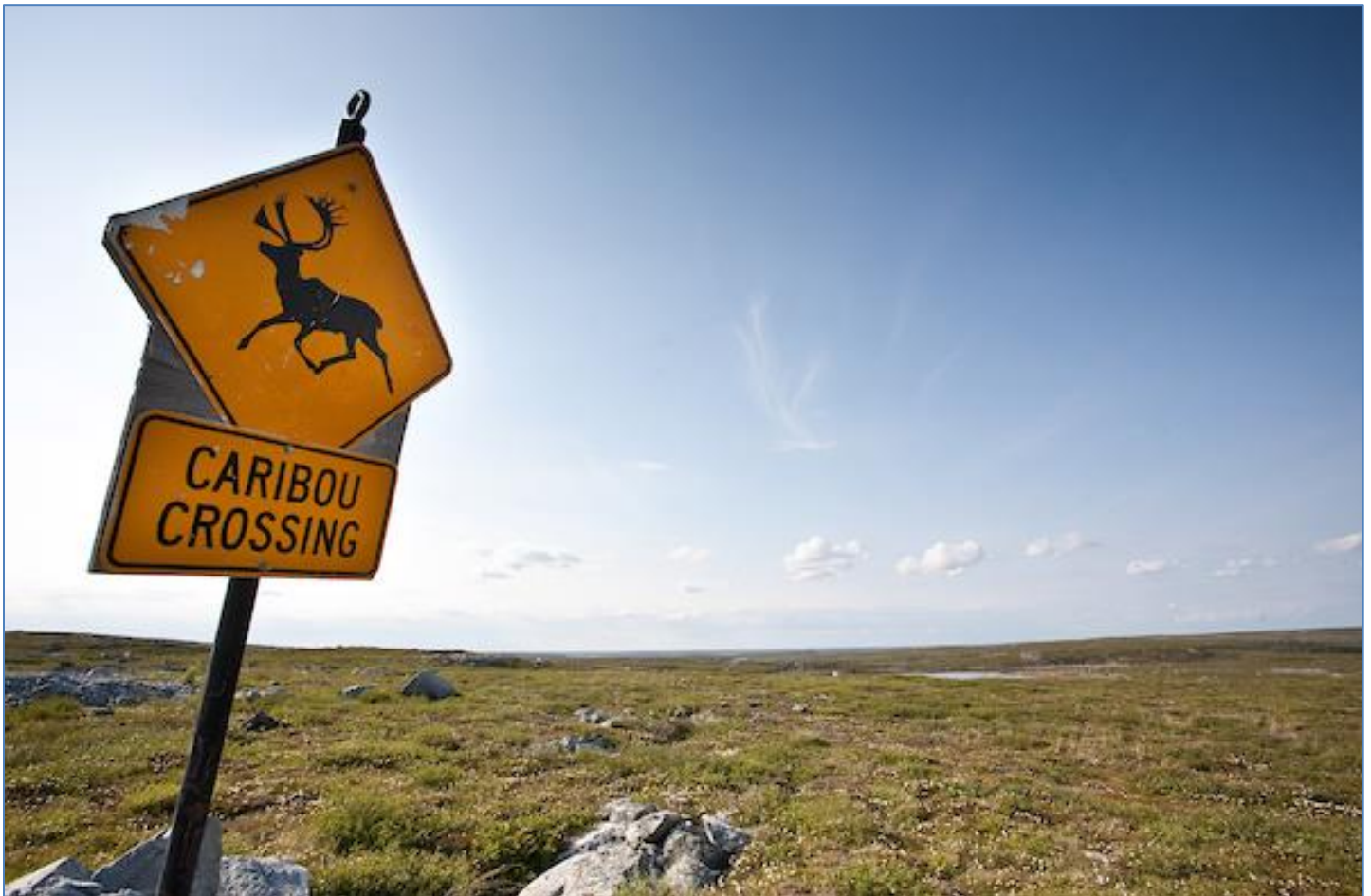
Photo 6 - Ekati Diamond Mine Caribou Crossing Signage.

There were no other specific reporting requirements noted in either the EA measures set out in the REA or summarized in Appendix A.