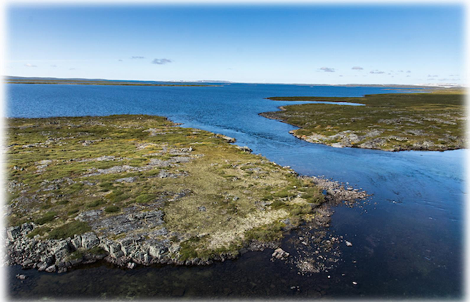
Photo 5 - The Narrows, August 2017.