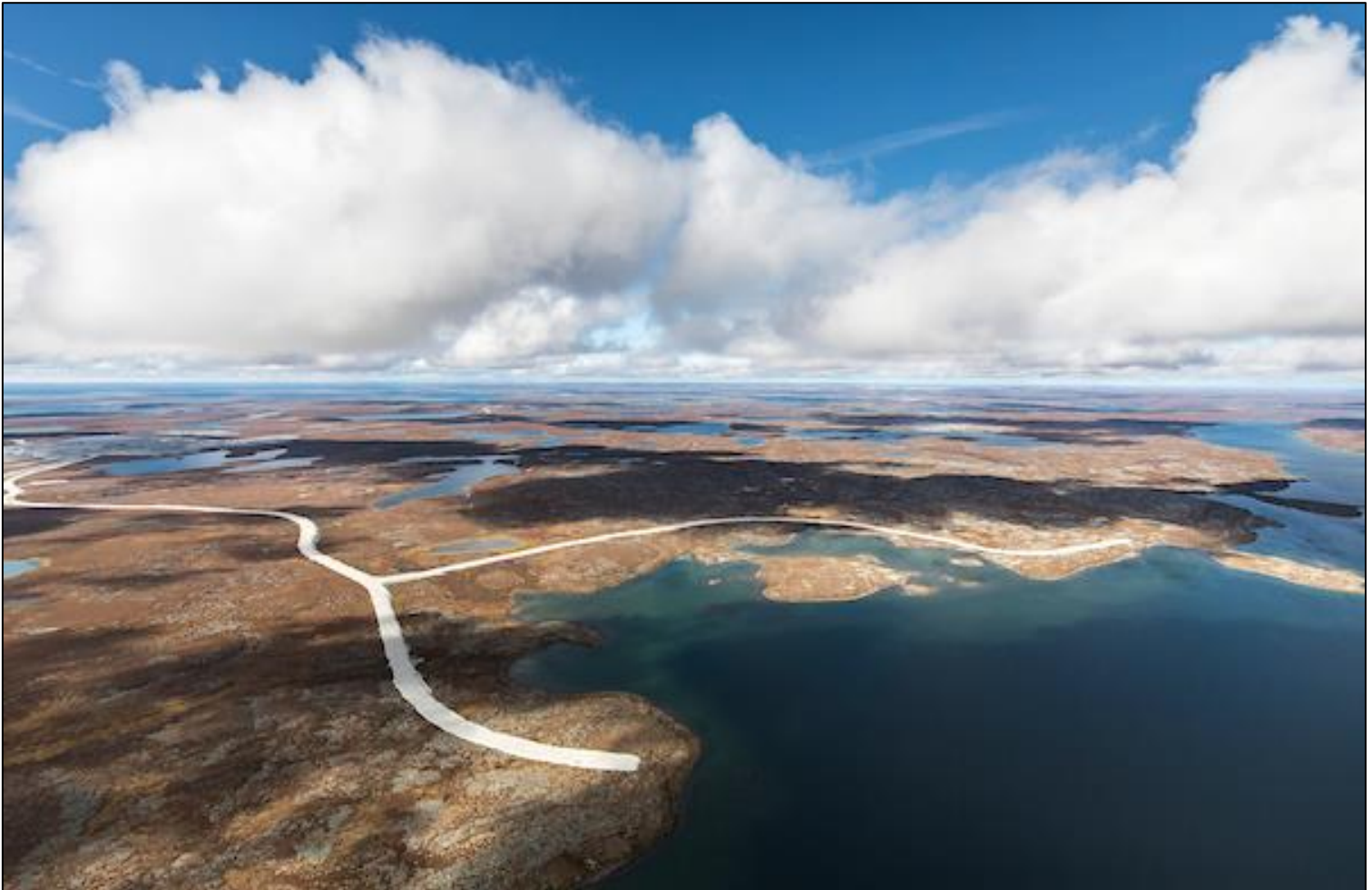
Photo 4 - Jay Project Area. August 2018.

There were no other specific reporting requirements noted in either the EA measures set out in the REA or summarized in Appendix A.