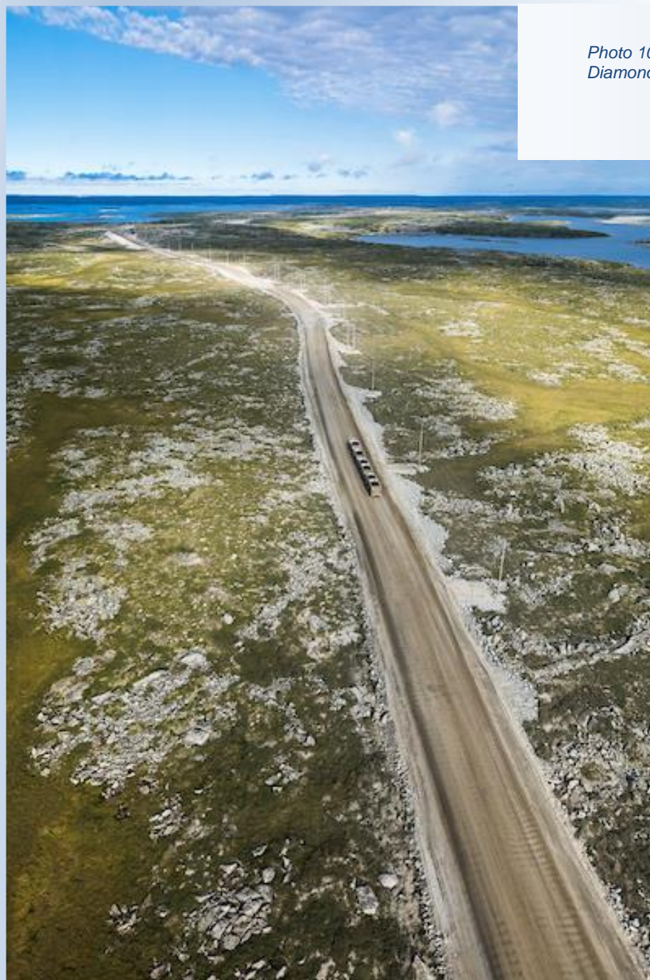
Photo 10 - Dual Powered Road Train (DPRT), Ekati Diamond Mine - Misery Haul Road, August 2017.

There were no other specific reporting requirements noted in either the EA measures set out in the REA or summarized in Appendix A.