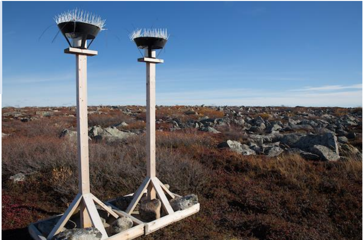
Photo 7 - Dustfall monitoring stations, Ekati Diamond Mine.

There were no other specific reporting requirements noted in either the EA measures set out in the REA or summarized in Appendix A.