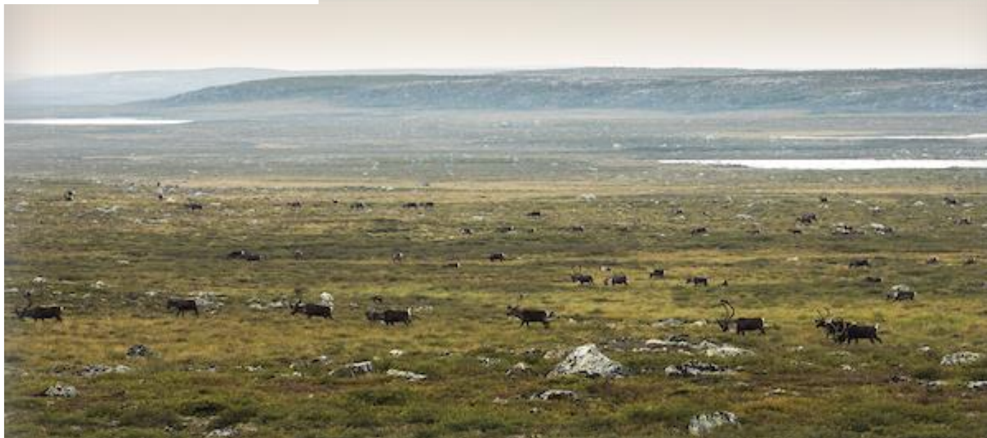
Photo 8 - Caribou, Ekati Diamond Mine.