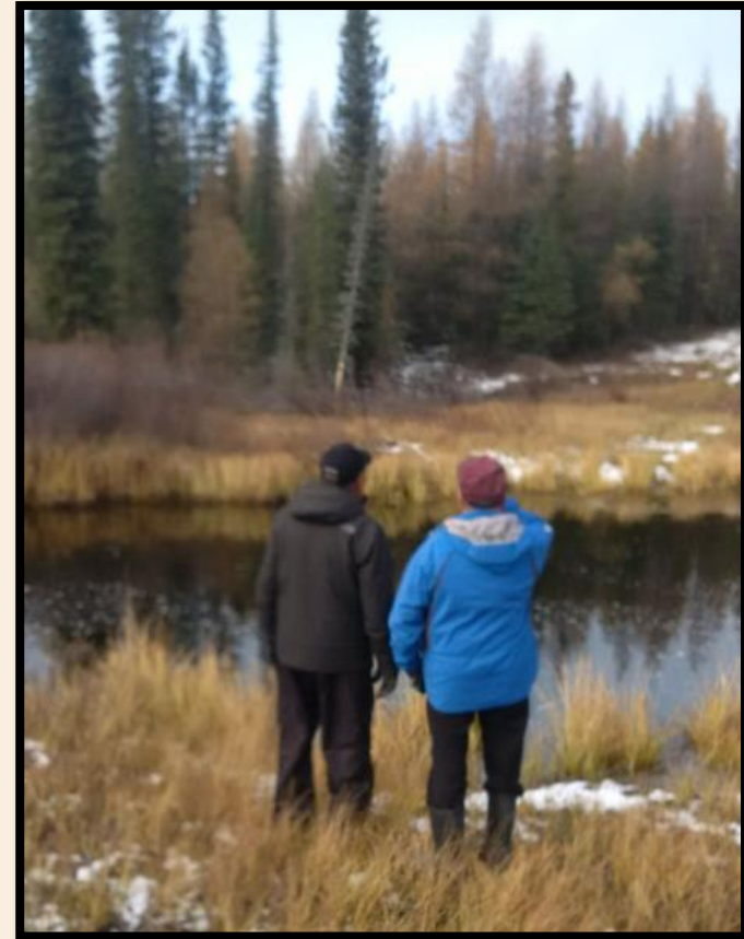
October 2017 elder site visit