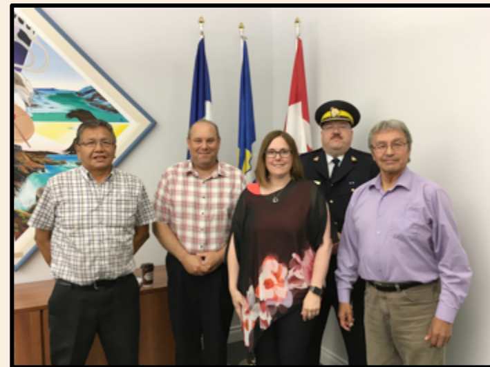
Signing of the MOU; Photo courtesy of Laura Duncan